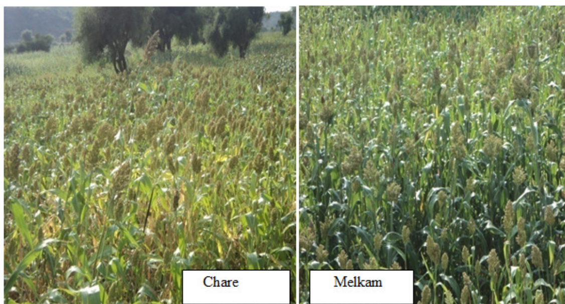
Figure 3. Performance of Chare and Melkam at heading stage in Tanqau Abergelle Wereda.